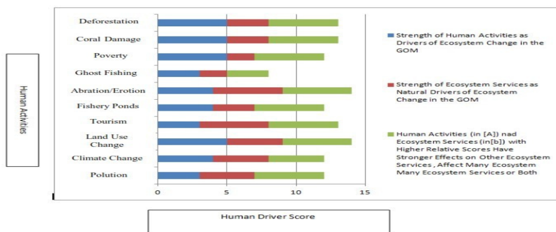
Figure 2: Ranking of ecosystem components in Pejarakan Village as a driver of ecosystem changes

Based on the results of EBM ecosystem services the activities that need to be stopped immediately are deforestation, destruction of coral reefs, construction of ponds, development of recreation areas, and changes in land use. For that reason, based on [1] to conduct mangrove restoration, the most responsible institution is the village government.